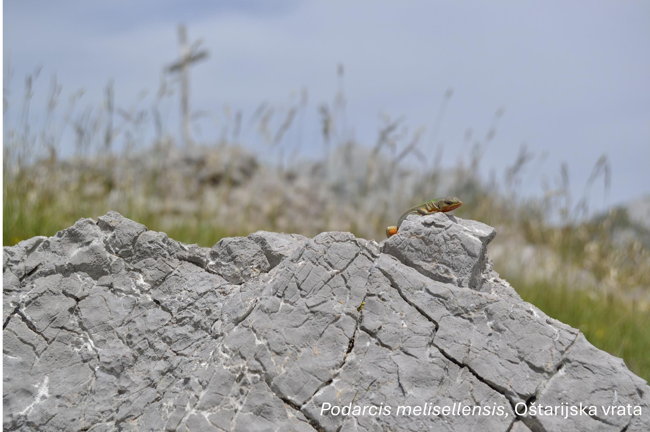
Podarcis melisellensis , Oštarijska vrata