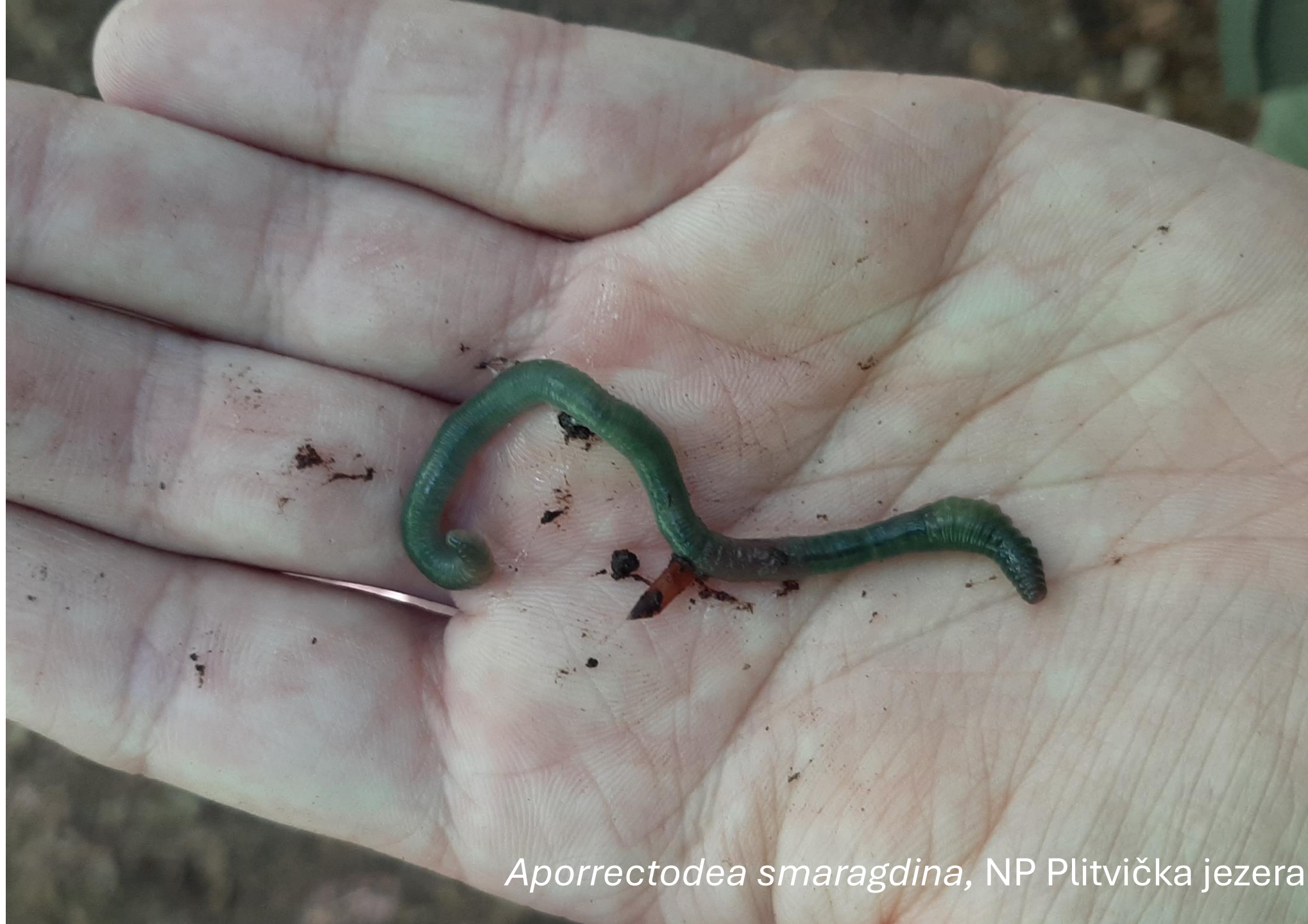
Aporrectodea smaragdina , NP Plitvička jezera