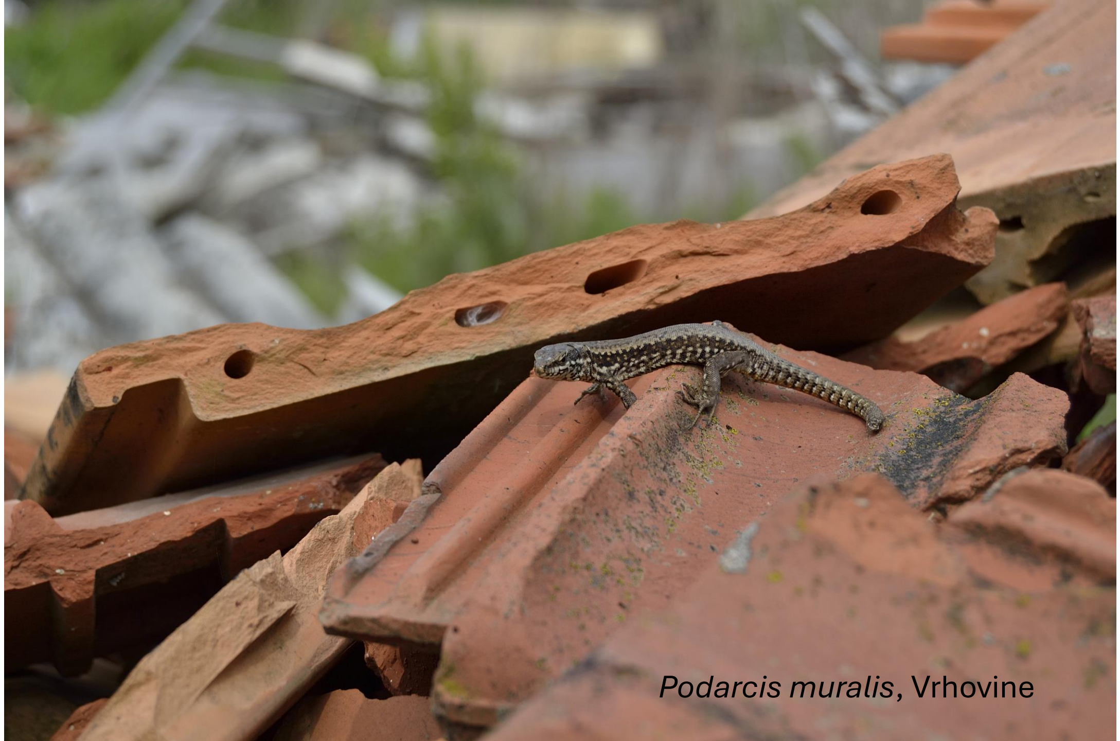
Podarcis muralis , Vrhovine