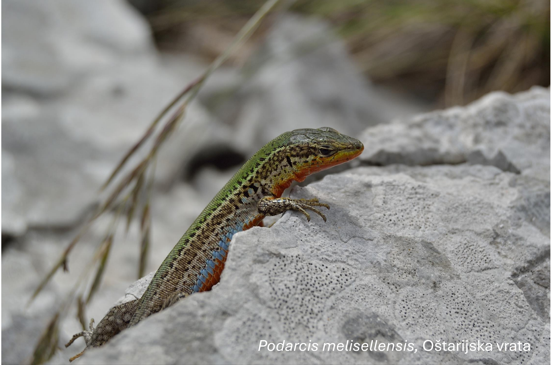
Podarcis melisellensis , Oštarijska vrata