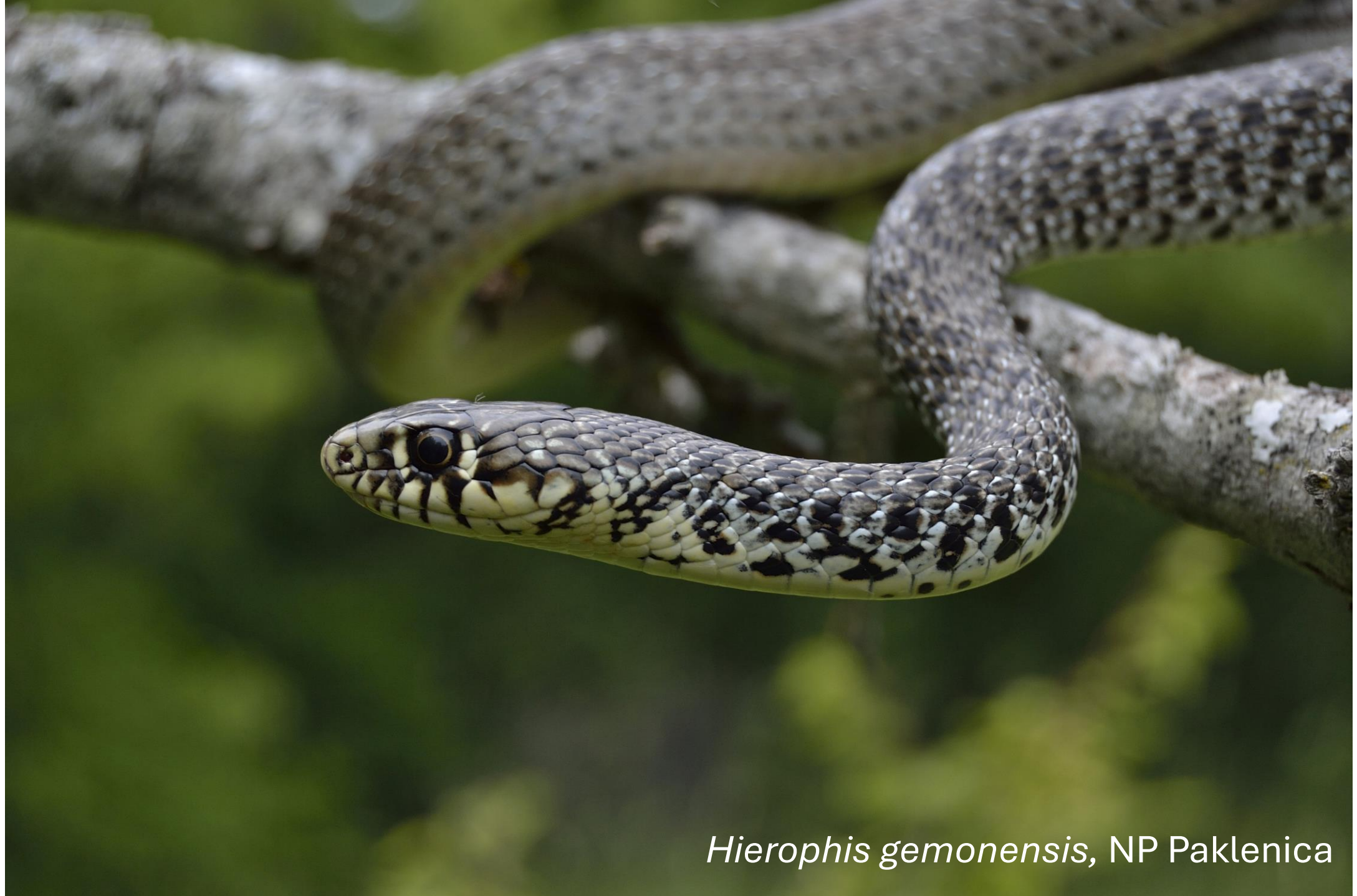
Hierophis gemonensis , NP Paklenica