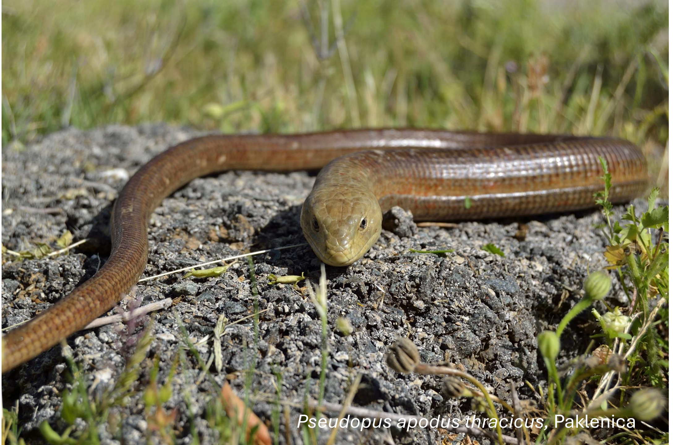
Pseudopus apodus thracicus , Paklenica