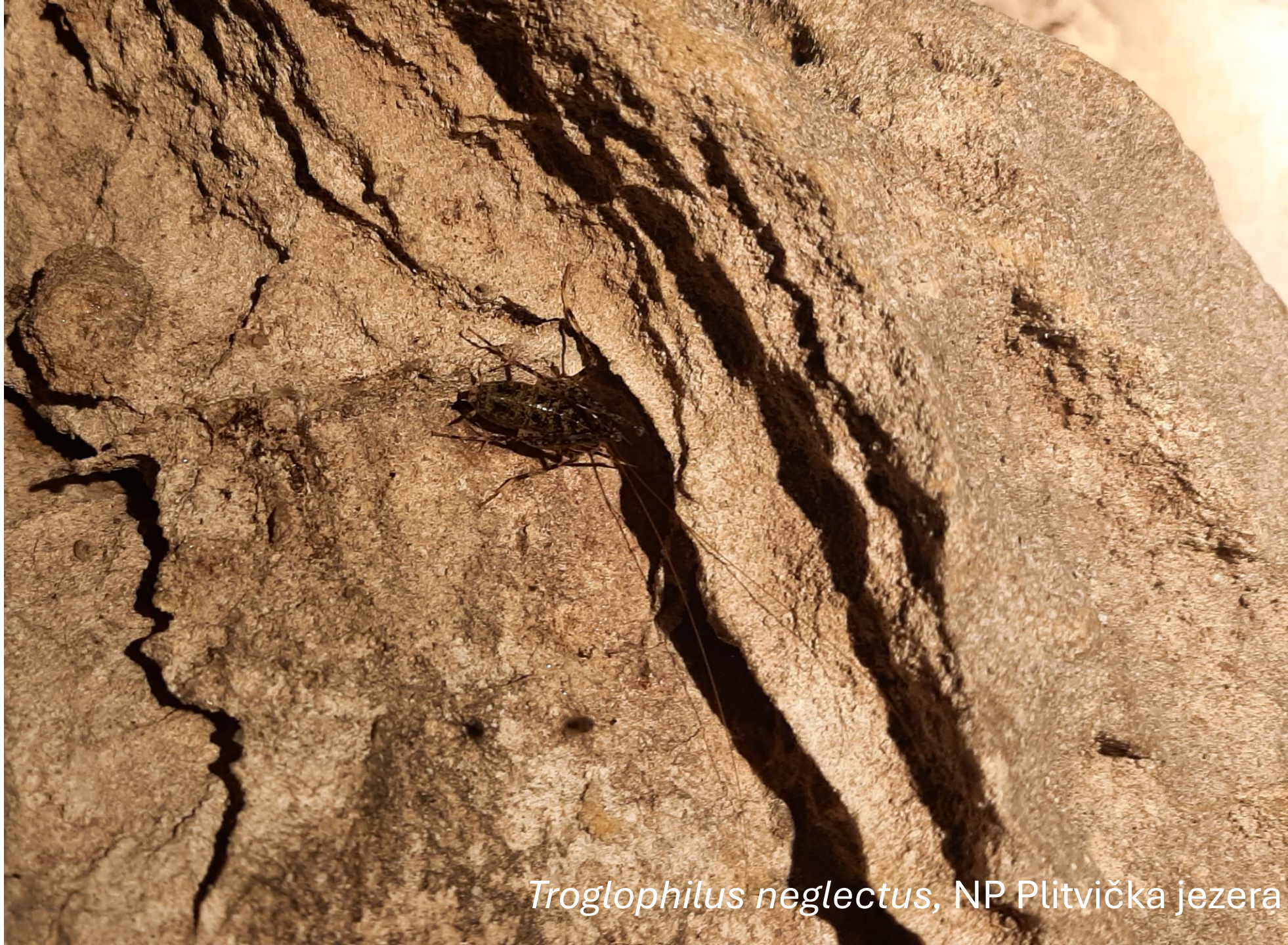
Troglophilus neglectus , NP Plitvička jezera