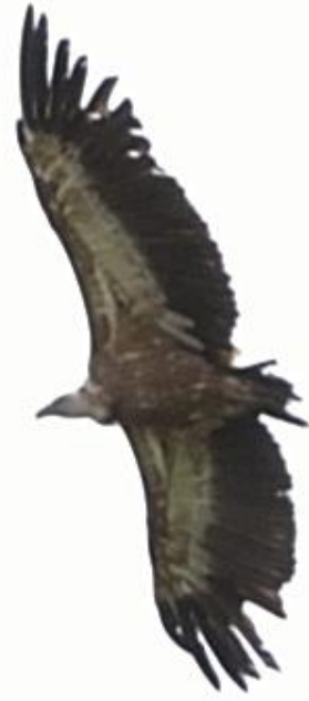
Gyps fulvus , Vojak