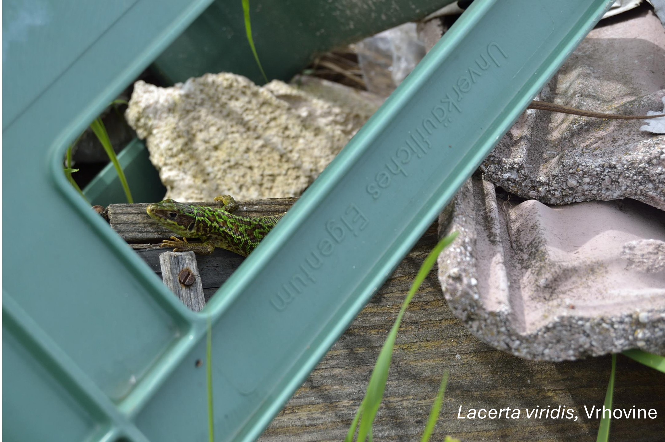
Lacerta viridis , Vrhovine