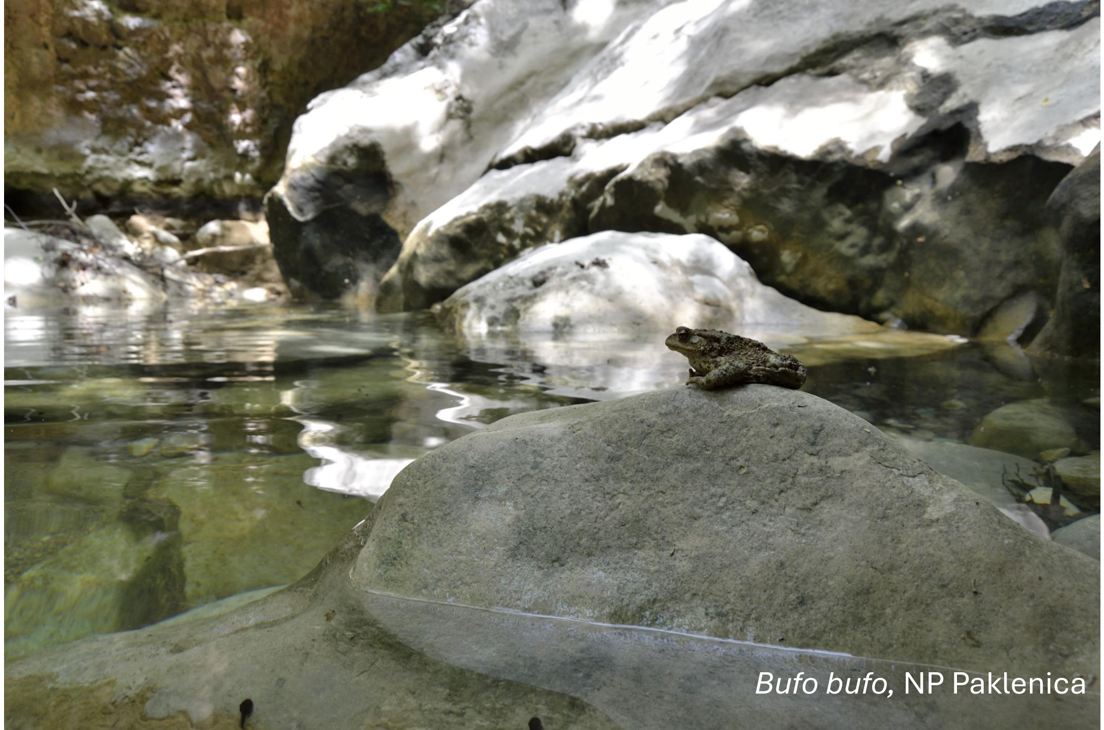
Bufo bufo , NP Paklenica