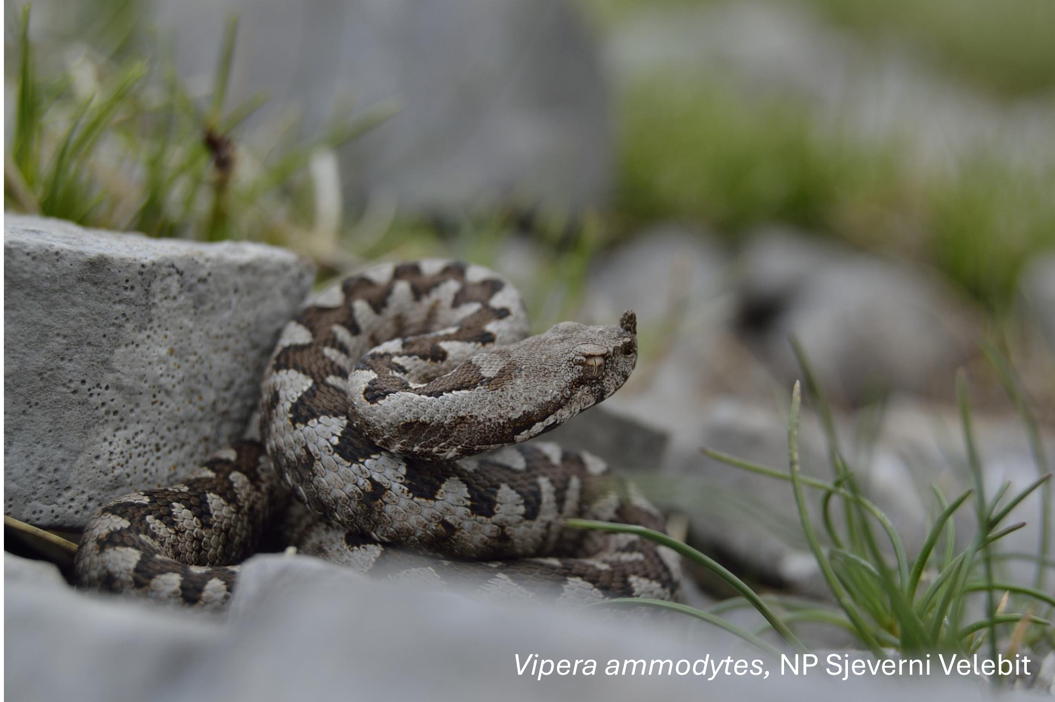
Vipera ammodytes , NP Sjeverni Velebit