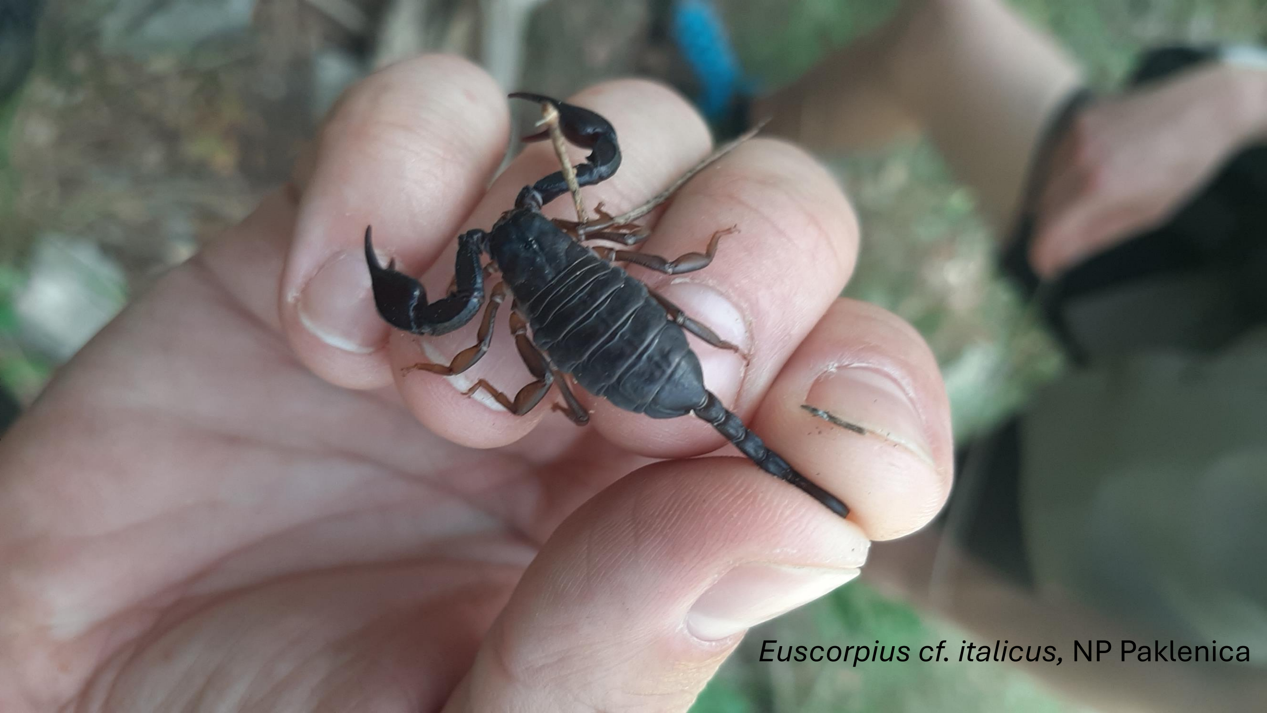
Euscorpius cf. italicus , NP Paklenica