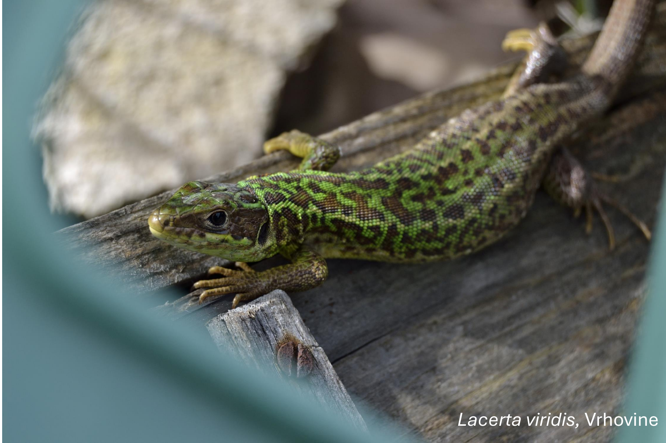
Lacerta viridis , Vrhovine