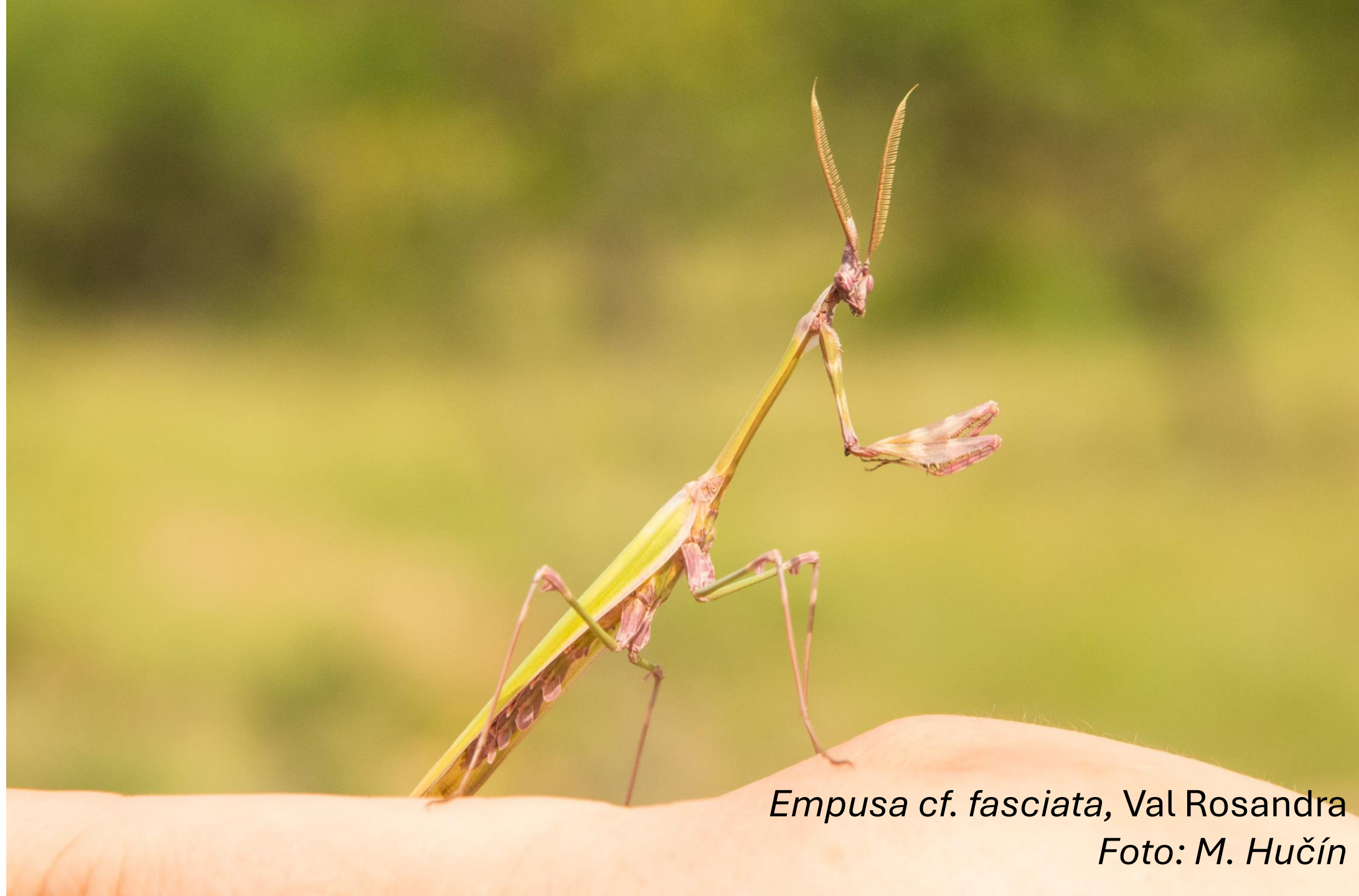
Empusa cf. fasciata, Val Rosandra