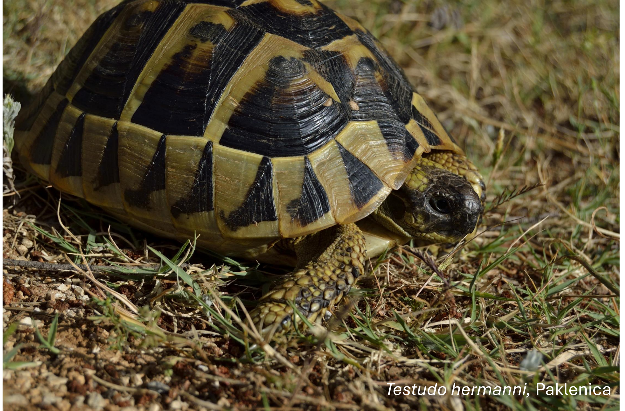
Testudo hermanni , Paklenica