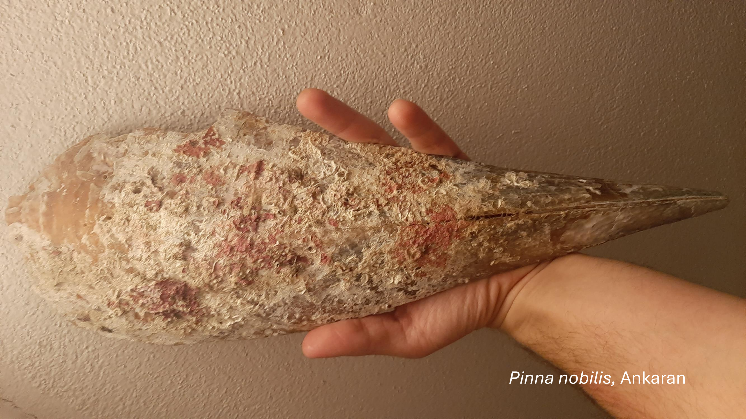
Pinna nobilis , Ankaran