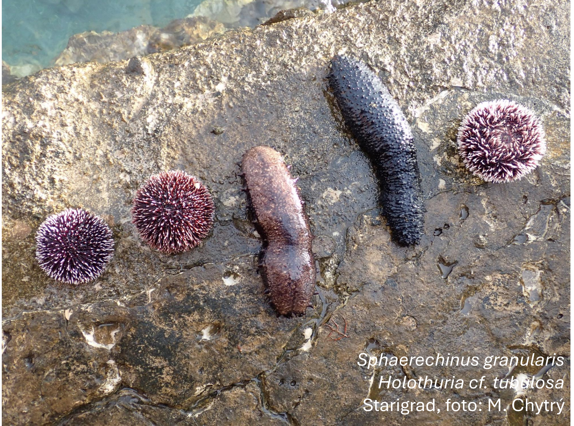
Sphaerechinus granularis Holothuria cf. tubulosa Starigrad, foto: M. Chytrý