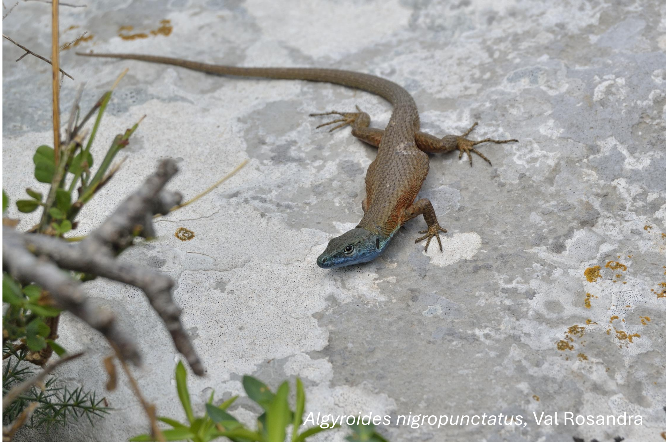
Algyroides nigropunctatus , Val Rosandra