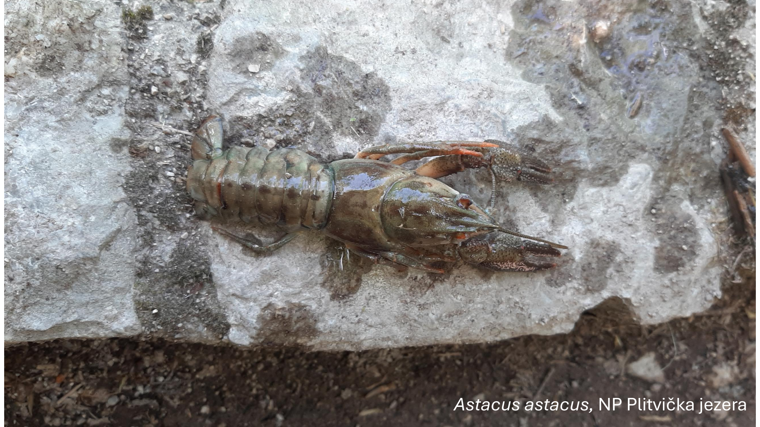
Astacus astacus , NP Plitvička jezera