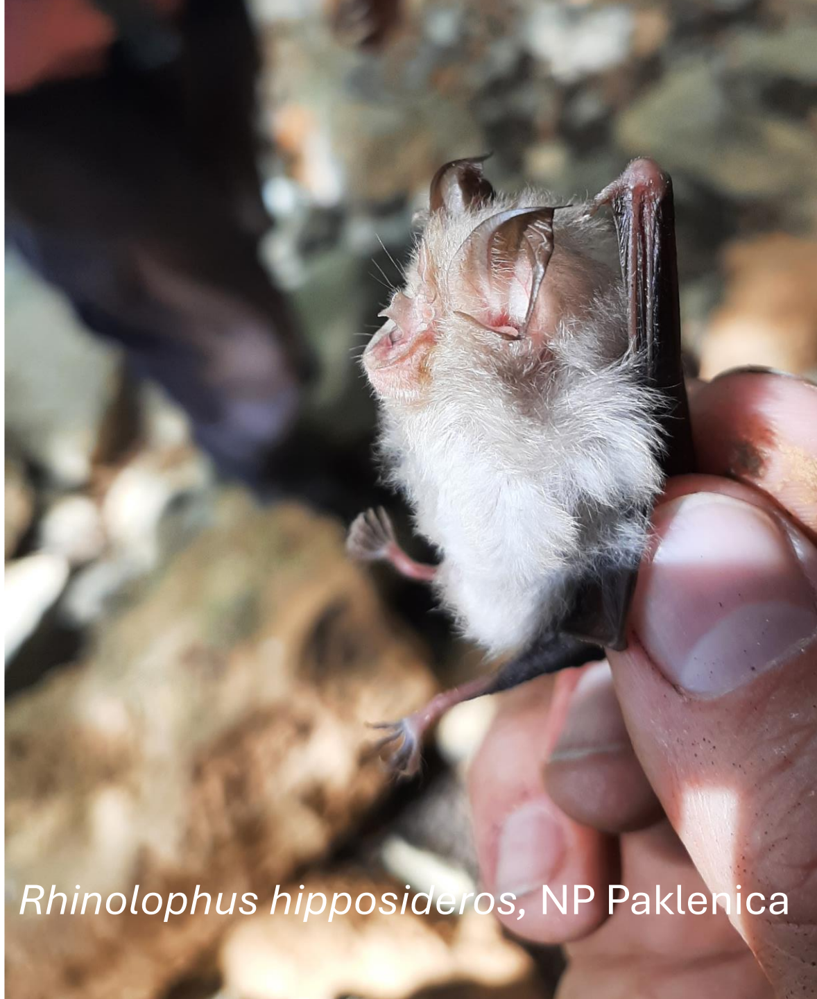
Rhinolophus hipposideros , NP Paklenica