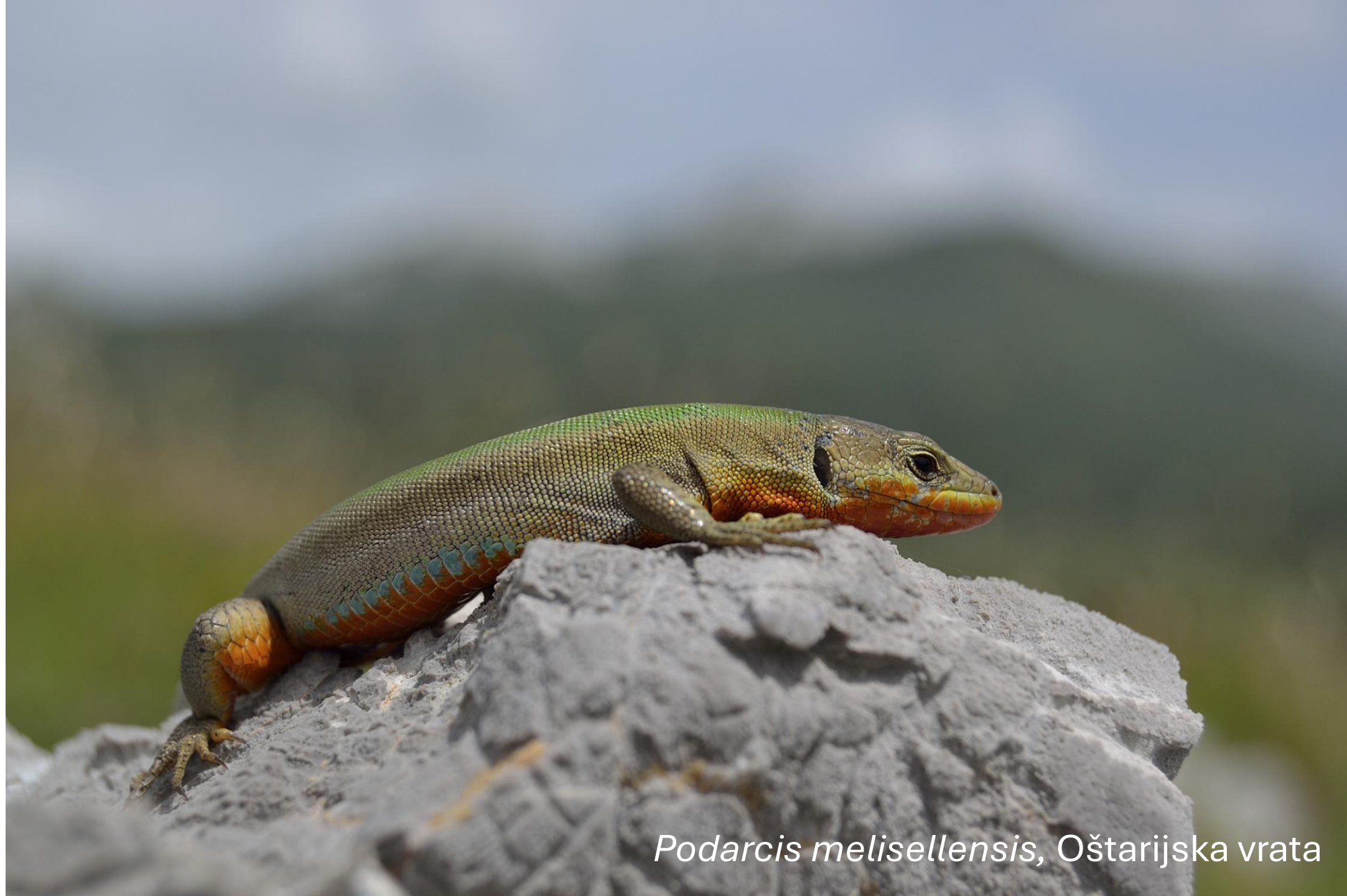
Podarcis melisellensis , Oštarijska vrata