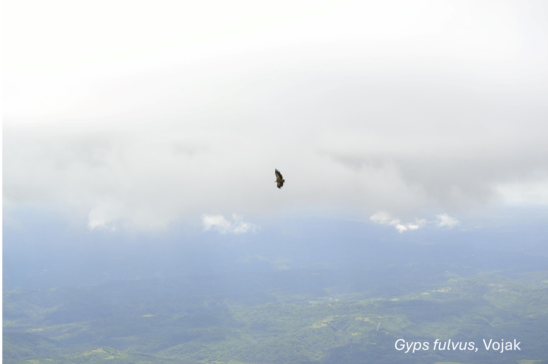
Gyps fulvus , Vojak