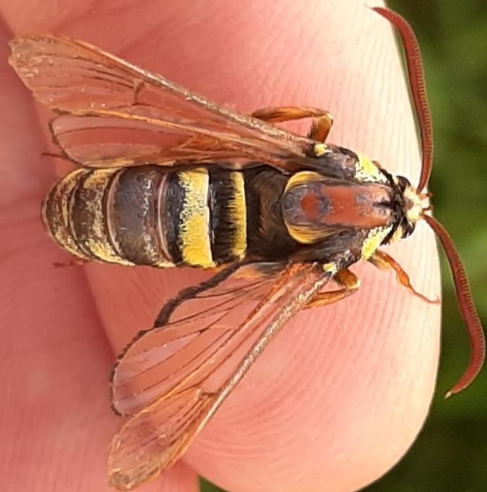
Sesia apiformis , nesytka sršňová