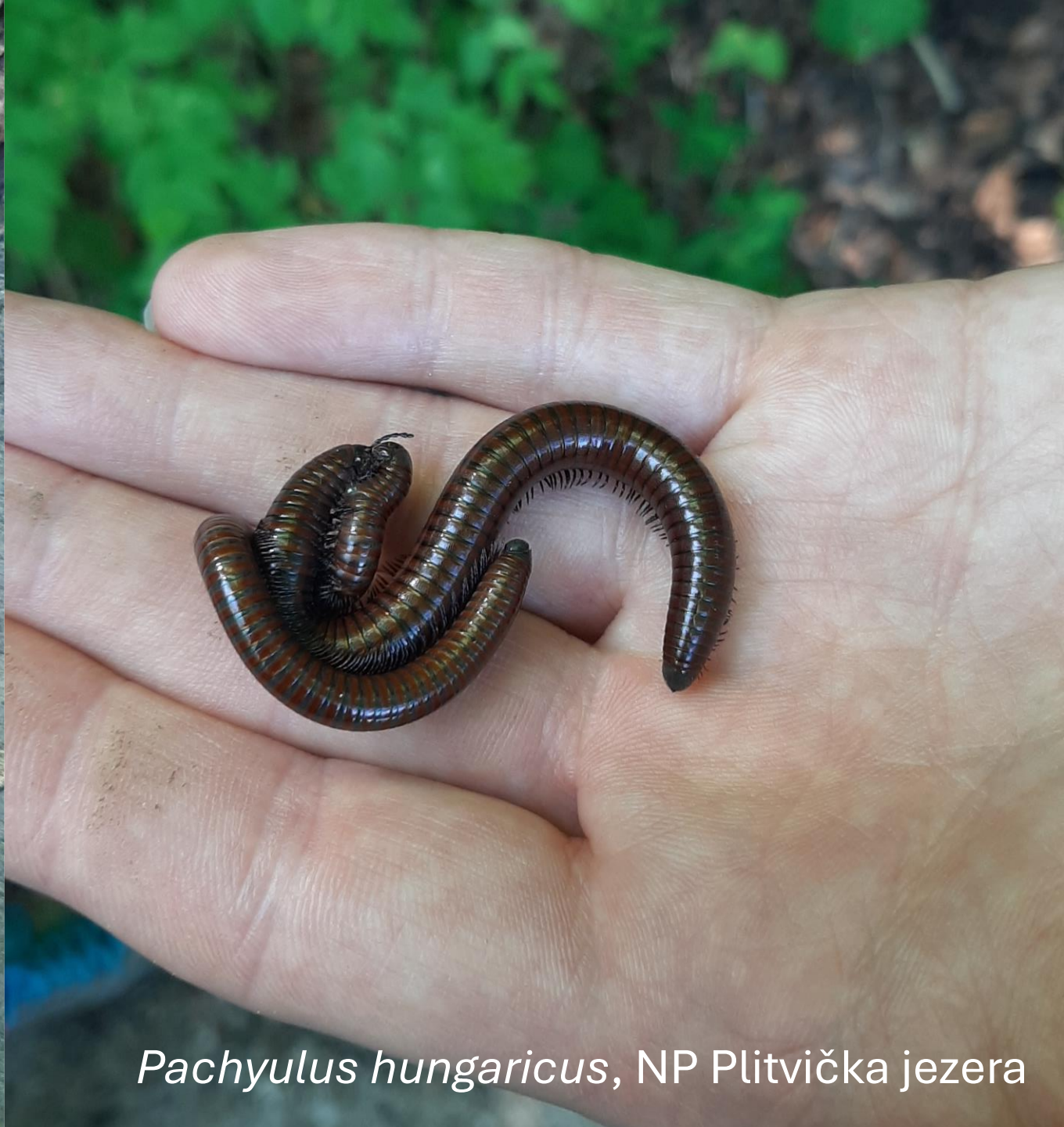
Pachyulus hungaricus , NP Plitvička jezera