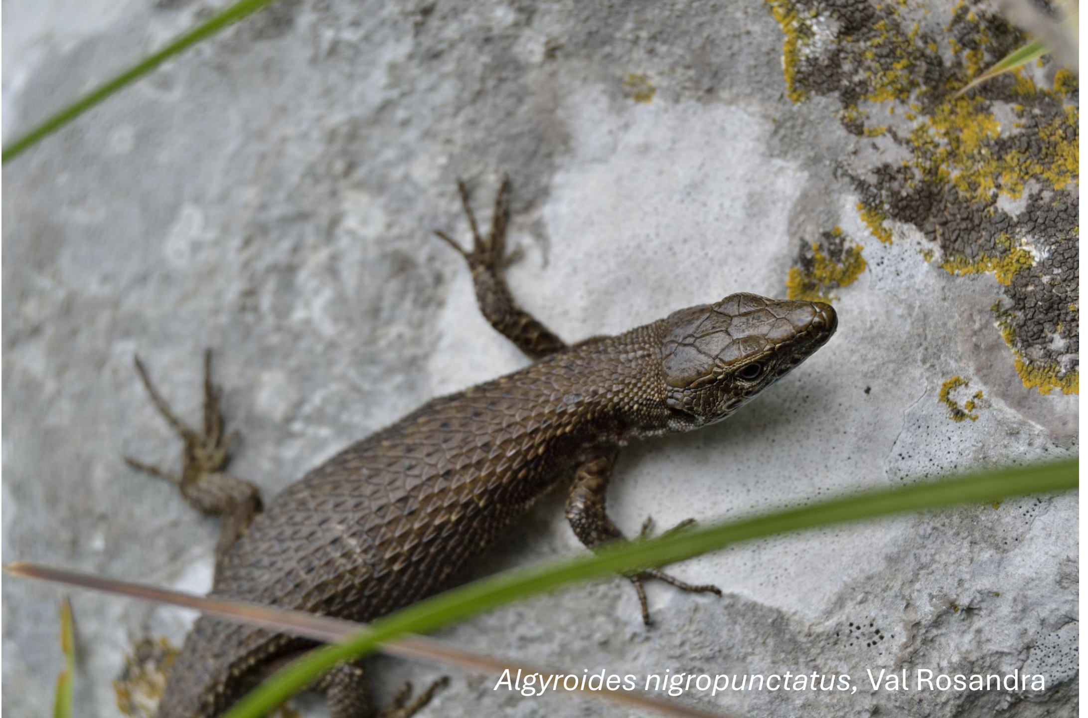
Algyroides nigropunctatus , Val Rosandra